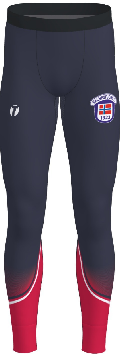
M5002 CORE ULTRALIGHT TIGHTS MEN flatlock: Black 9700