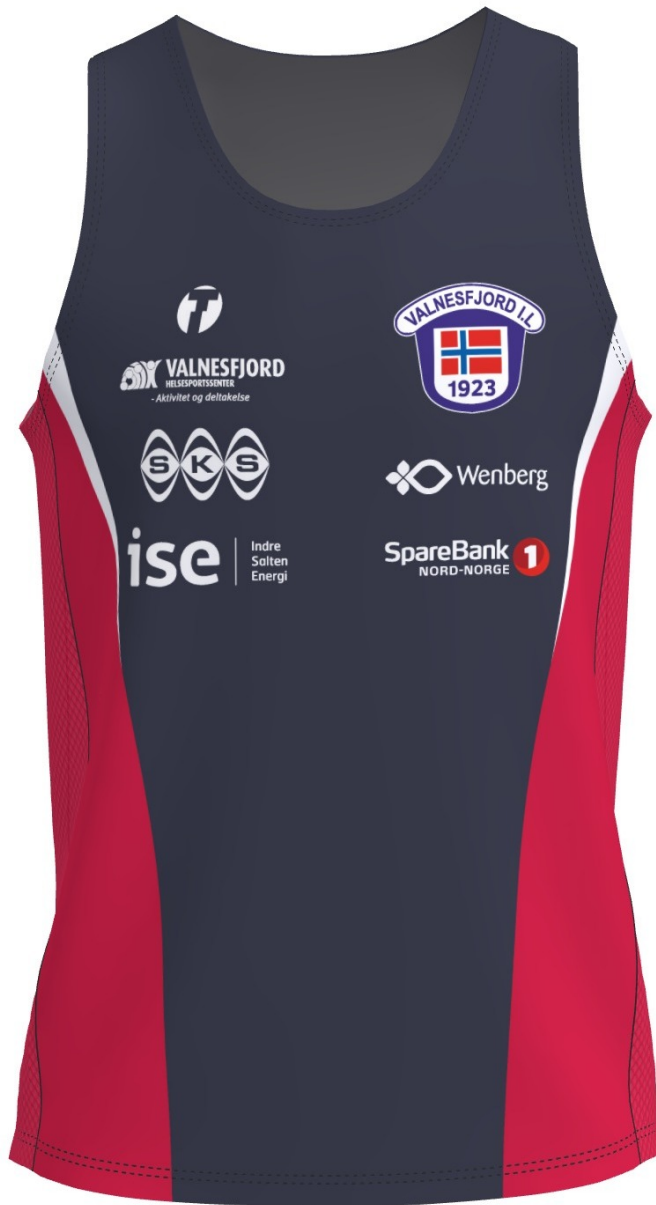
C19.2-L RUN SINGLET MEN thread: Black 9700 flatlock: Black 9700