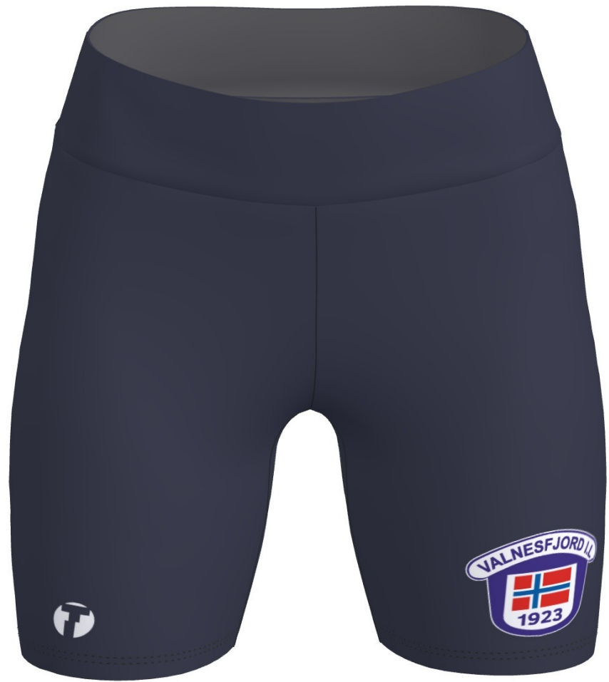
B337-L RUN 2.0 SHORT TIGHTS WOMEN thread: Black 9700 flatlock: Black U9500

DISCLAIMER: Order is produced according to the latest approved design proof. Customers responsibility is to ensure that logo(s) and color(s) are accurate. Colors may appear different on your screen or printed paper. Colors may have \pm 5\% \Delta E \leq (CIE 2000), compared to different materials and tints. For a particular result ask colortest from your sales representative. Design proof is based on L sized garment, design may vary with each size. We highly recommend to avoid continuity of design between two different part of product - Trimtex will not guarantee perfect result for this. Copyright © Designs are property of Trimtex, protected by copyright and allowed to use only on Trimtex products.